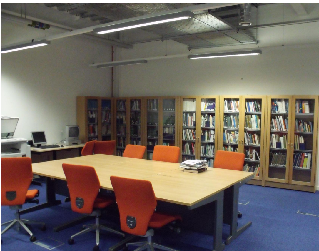
Images of the Archive Reading Room.